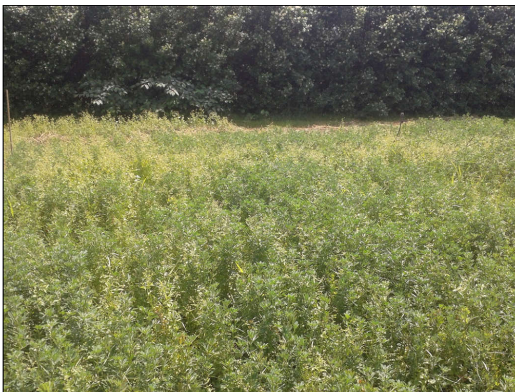
Figure 2. Fenugreek stock on 4 th of June 2018

The spring-type T. foenum-graecum can be harvested in 80-90 days after seeding (Figure 2).