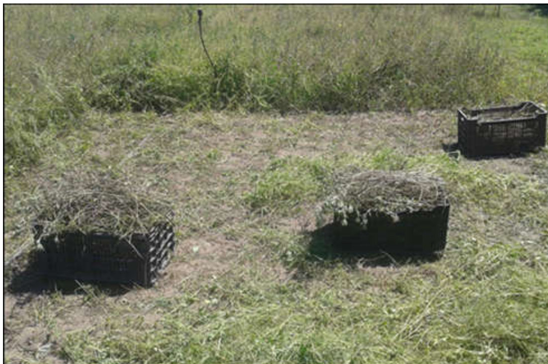
Figure 3. The harvest of fenugreek (3 th July 2018)

The harvest was at the end of June and early July, when the biomass was recorded ( Figure 3 ).