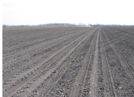
Figure 2. Plough technology soil preparation

The seedbed was suitable for sowing, porous, crumbled consistency, however there was a lack of precipitation in the period before sowing. It could be due to the low level of humidity in the soil or sometimes the uneven soil that the seed did not always get into wet soil.