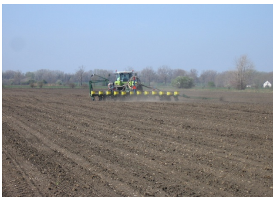
Figure 1. Ripping technology soil preparation

The research was carried out in the fields of Hód-Mezőgazda Zrt, Hódmezővásárhely, where the sowing took place in seed beds prepared for sowing in two different ways. One of the fields was prepared with the traditional technology (disking, ploughing, seedbed preparation) ( Figure 2. ), while the other field was prepared without turning the soil (ripping technology, disking, seedbed preparation) ( Figure 1. ) for preparing maize sowing.