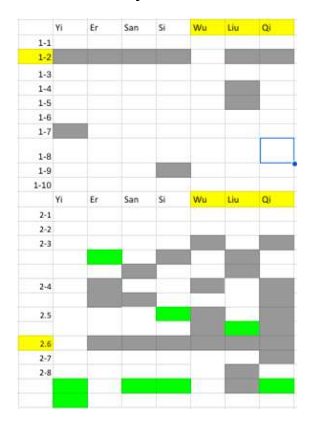
Figure 2. Map of students' responses

To understand the influence of cultural and linguistic knowledge on students' listening comprehension, this study analyzed the responses of seven students to questions about two different videos. For the first video (Lanz, 2017), a five-minute exposition on focus groups by TED, students were presented with ten questions in a Google Form in which they were to fill in ten gaps with two words. For the second video, a debate over the role of slang in the classroom sponsored by The Guardian (2013), students were presented with eight open-ended questions. The responses of seven students were pulled to use in this content analysis. Four students, Yi, Er, San, and Si, not their real names, made the four highest scores in the class. Three students, Wu, Liu, and Qi, also not their real names, made the lowest scores in the class. Figure 2 maps the result of these tests. The gray boxes indicate responses that do not match the answer key and were not awarded any marks. The green boxes indicate responses that do not match the answer key, but were awarded marks.